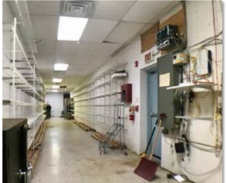
Storage Area in Rear