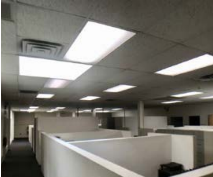
15 Private Offices Along Perimeter