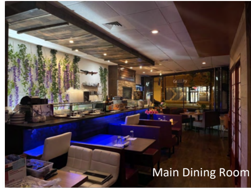
Main Dining Room