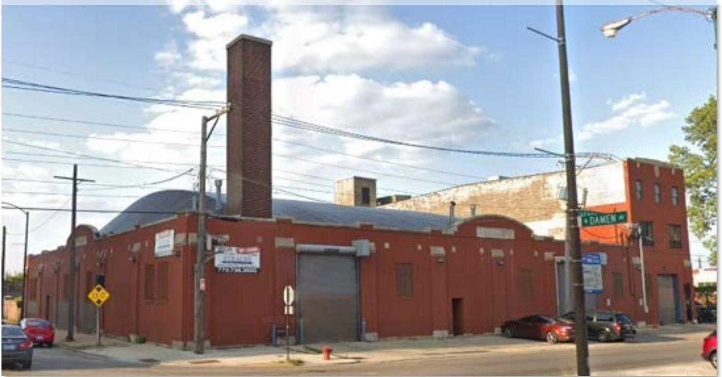
STEEL, BOW-TRUSS, CLEAR SPAN SINGLE STORY BUILDING ON THE CORNER OF DAMEN & CARROLL IN THE KINZIE INDUSTRIAL CORRIDOR.