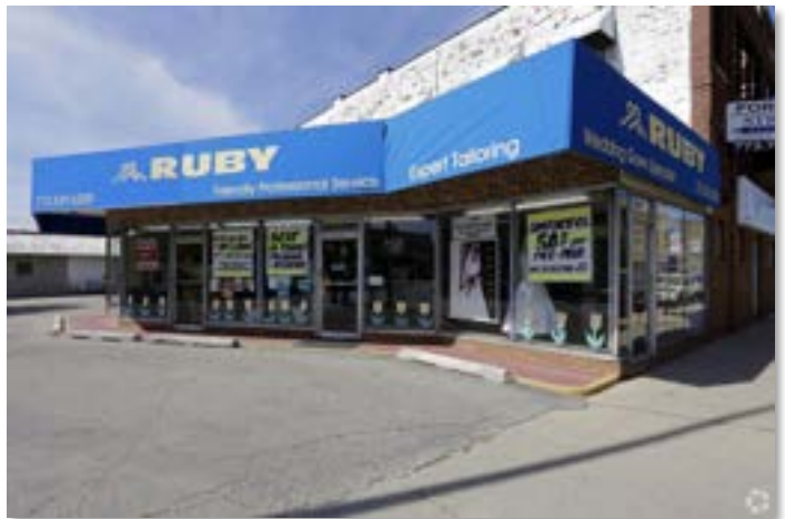
Additional buildings included with parcel.